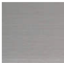
Clear Anodized Aluminum Finish *Image may not accurately reflect actual finish